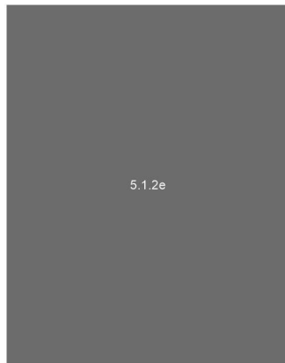
One of the 3 labs in use in Romania 2020