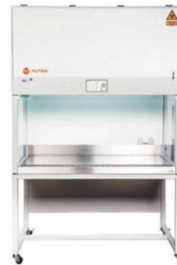
Included BSL II cabinet